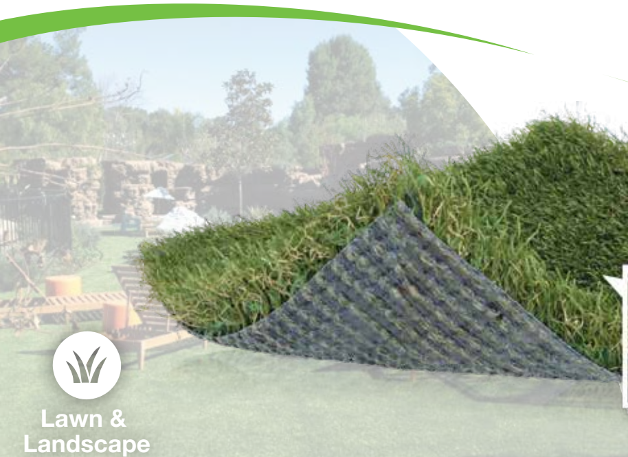
Lawn & Landscape